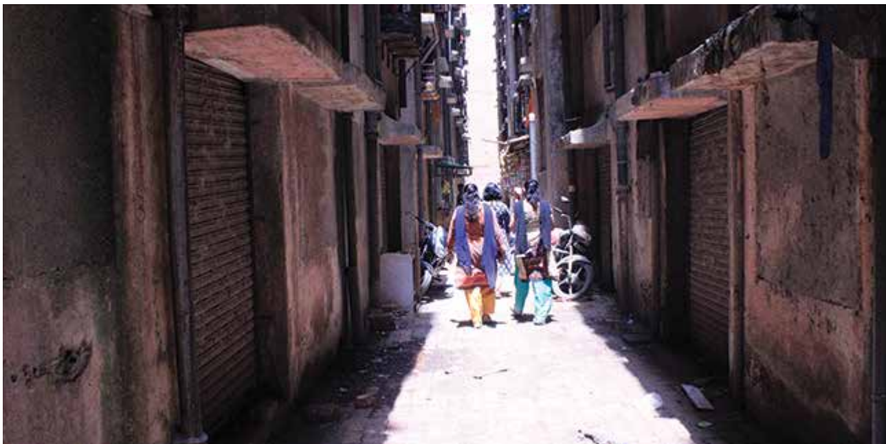
2.4 Alleyways in RNA colony

Unlike Tata Nagar, residents were provided access to basic facilities like electricity, water and sanitation (inside homes). As with Tata Nagar though, water is available at fixed times in the day. The nearest government hospital is Shatabdi at a distance of over six kilometres. There is a health post within Vashi Naka, but it only offers basic services such as immunisation. A number of private doctors have set up clinics in the area, although it is not clear if their qualifications match their stated expertise. Chemists are also available alongside the settlement. Incidences of health issues are high, because of the presence of two refineries next to the colony. The poor