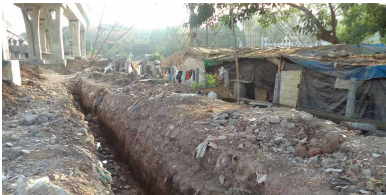
2.1 Living on the margins

Though initially uninhabitable, and covered with tall grass, the area was cleared by power companies Tata Power and Reliance to set up their power lines. Comprising an area of around 1 acre, it is now populated with homes punctuated by narrow streets. Most homes in Tata Nagar