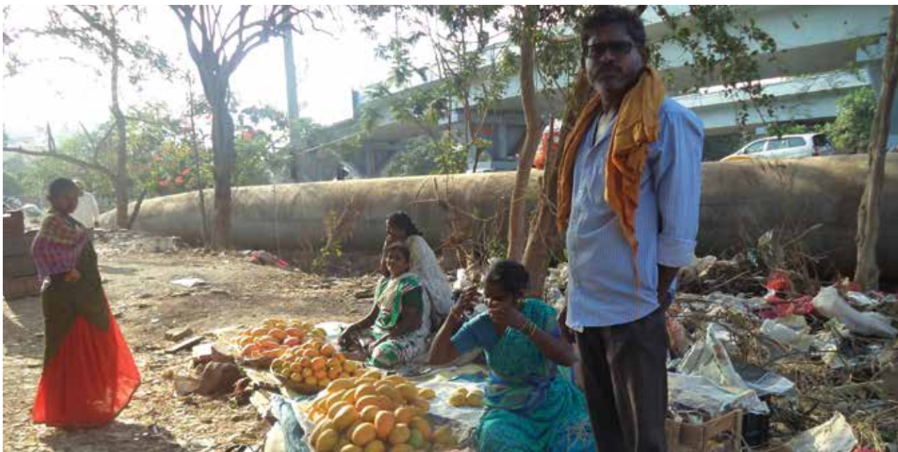
4.4 Mango season in Tata Nagar, Photo Credit: Aradhana

Summers bring an increase in consumption of dairy products such as curd and buttermilk in households that can afford it, while winters allow for heavier (oilier) foods. The monsoons force some changes in vegetable