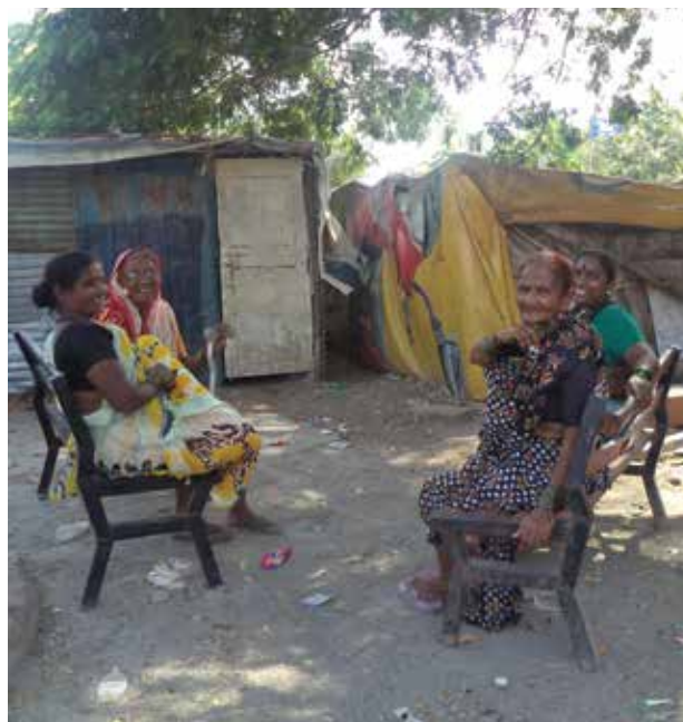
4.14 Residents of Tata Nagar sitting together enjoying a chat

In the absence of state support, people turn to other social structures for support. A key idea that emerged through the urban poor's articulations of community was that of the networks of support through neighbours, family, civil society organisations and inter-class relations formed through paid domestic work. However, the importance of such associations became varied across sites.