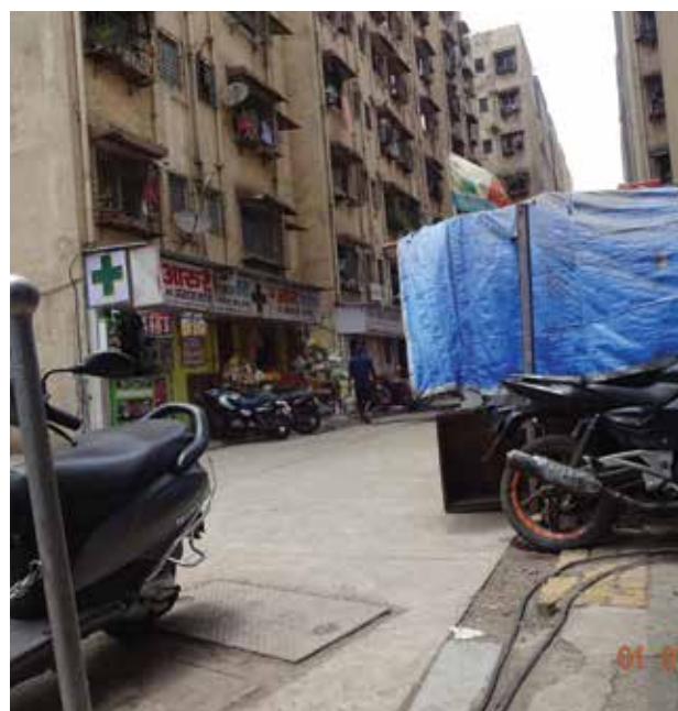
2.3 A street in RNA colony where higher floors of buildings are residences and several shops have opened on the ground floors facing the streets

The population of RNA Colony is estimated to be approximately 5,500 living in roughly 2,598 tenements. In buildings that are eight storeys high, each tenement