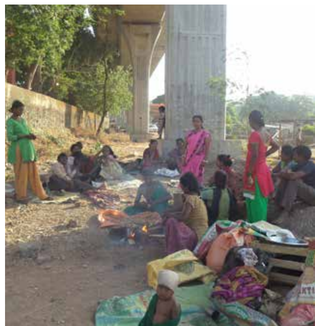
4.15 Negotiating spaces and rights, Tata Nagar, Photo Credit: Aradhana

In 2005, water had spread everywhere because of flooding. We didn't even have a piece of cloth left. There was no food, appliances, no utensils. But Tirandas (a businessman who owns a small garden adjacent to