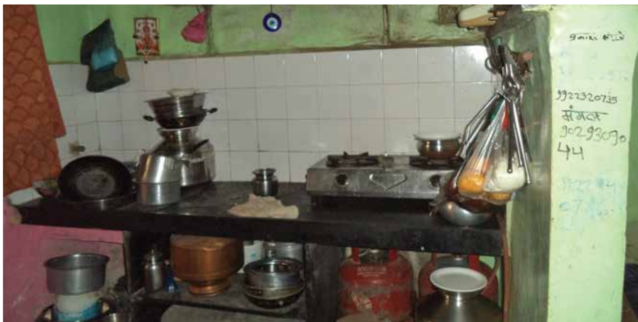
4.17 A kitchen space in RNA Colony