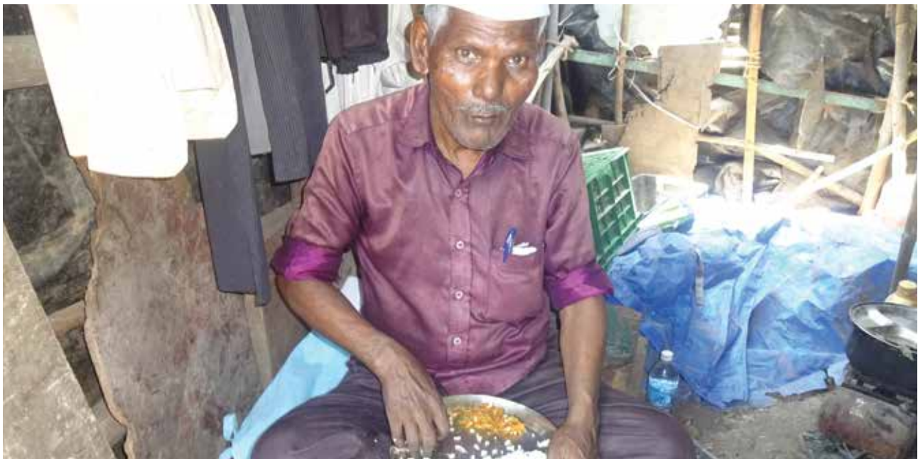
4.16 A resident of Tata Nagar enjoying a home cooked meal