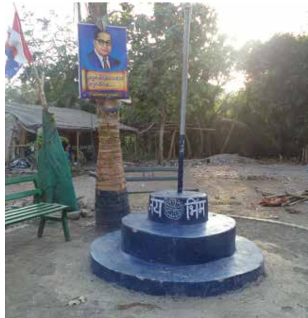
2.2 Jai Bhim Flag Pole in the middle of the Tata Nagar settlement

The monsoons are a particularly challenging time for the residents due to incessant flooding and increased diseases. Several residents fall sick because of diseases like dengue or malaria. The closest municipal hospital in Sector 2 is a kilometre (km) away, where families go for treatment. However, due to the inconvenience of hospital timings for working residents, private hospitals such as D Y Patil