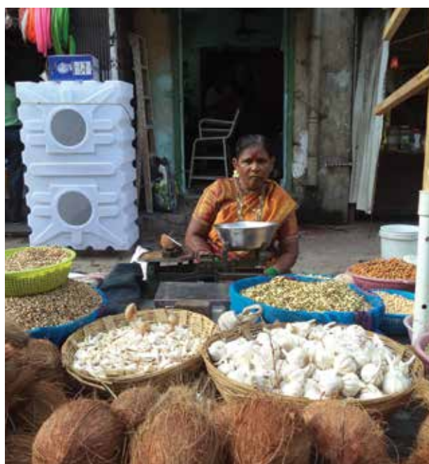
4.11 A woman in RNA Park who is the primary caregiver and also brings in the primary source of income.

I have to make the money and buy the meat. And then I have to cook it too. So that's a huge load, right?