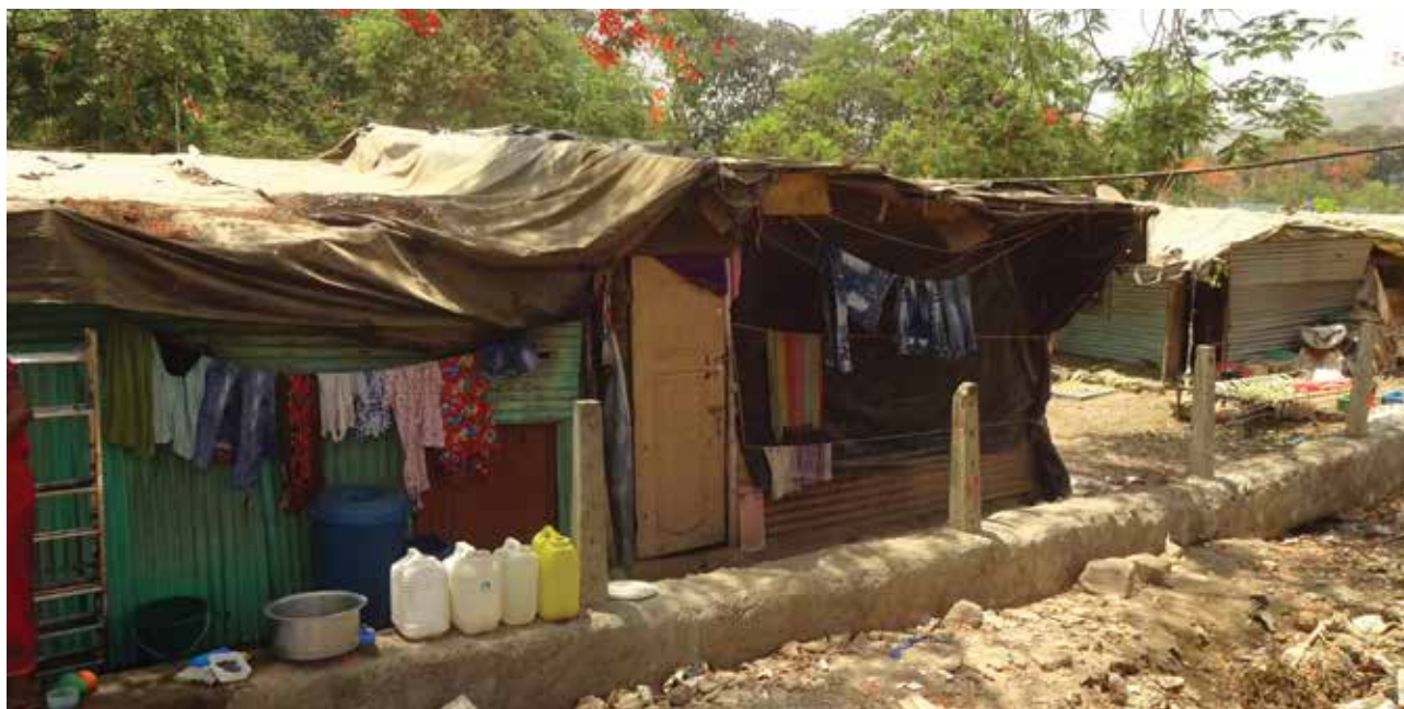
4.12 Residents of Tata Nagar continue to live in temporary homes due to the uncertainty of demolitions by the SRA.

This fear of poor quality food and disliking of bland food is a common concern of primary caregivers whose children receive mid-day meals at school. Though the scheme shares the burden experienced by urban poor caregivers to feed their children, these concerns about the quality of food and children's lack of desire to consume such food often propel primary caregivers