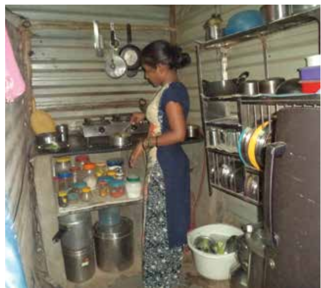
4.8 A resident of Tata Nagar preparing a meal in her home