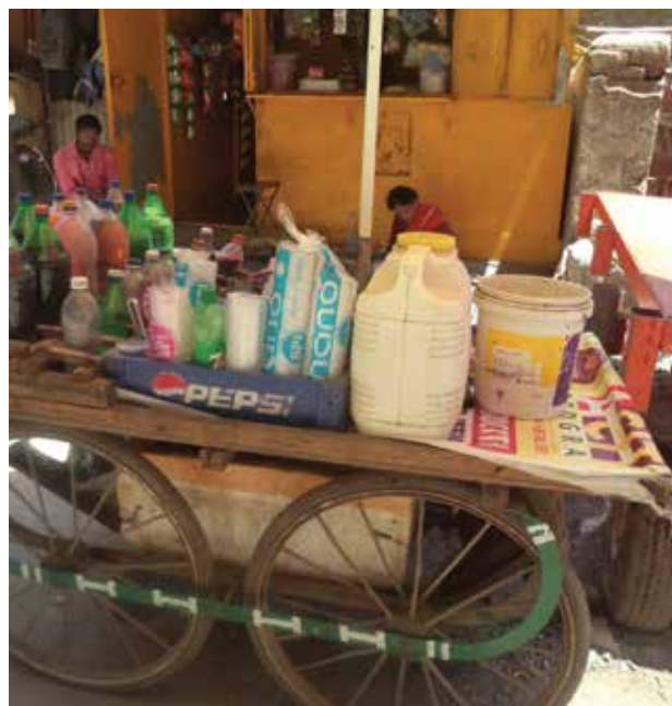
4.2 Beat the heat

pasta dish, indicating a wide range of cuisines consumed. Financial constraints in some families meant that eating out may be limited. Geeta, a resident of Tata Nagar, for example, buys only a vada pav occasionally, when she feels uncontrollable hunger.