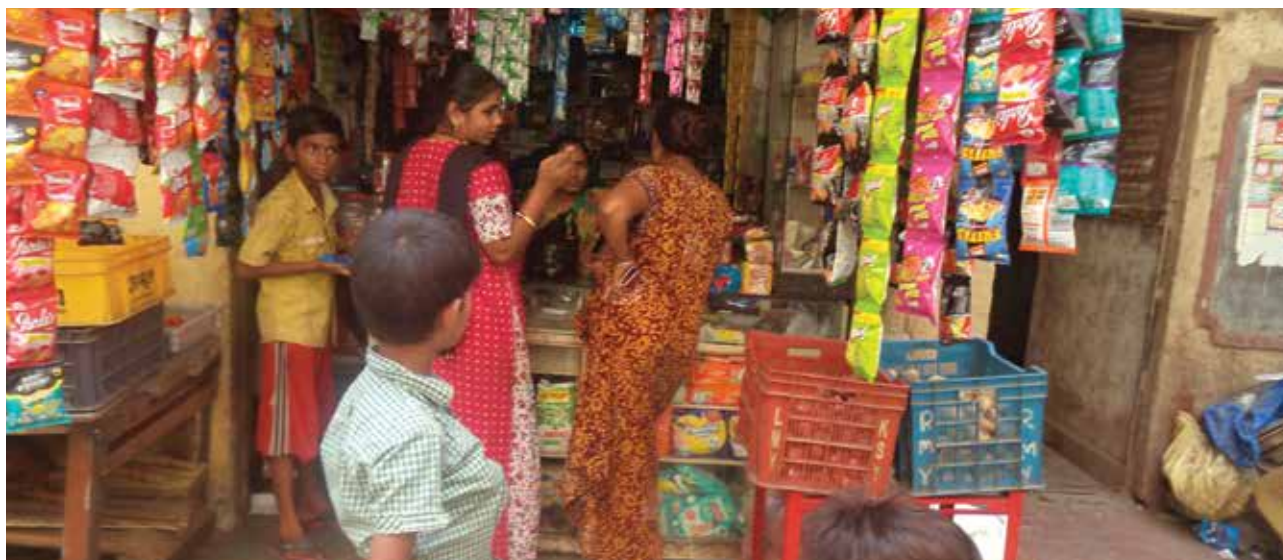
4.6 Grocery store located in RNA Colony, Photo Credit: Ameena

Ankita, a resident of Tata Nagar, provides another example of a fixed food network that catalyses food procurement patterns. Despite having migrated months