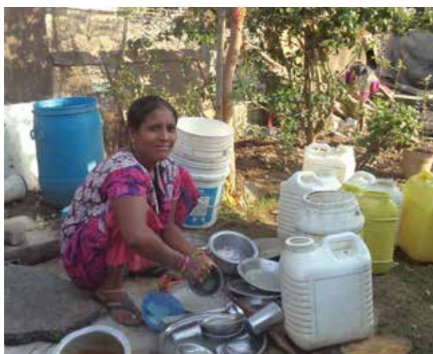
4.9 A woman in Tata Nagar washing utensils outside her home, Photo Credit: Aradhana

While food is a basic necessity for survival, the lived realities of people greatly impact their relationship with food, specifically what and when they eat. Employment emerged as a crucial factor in determining how individuals negotiate access to food. The nature of their work emerged as a