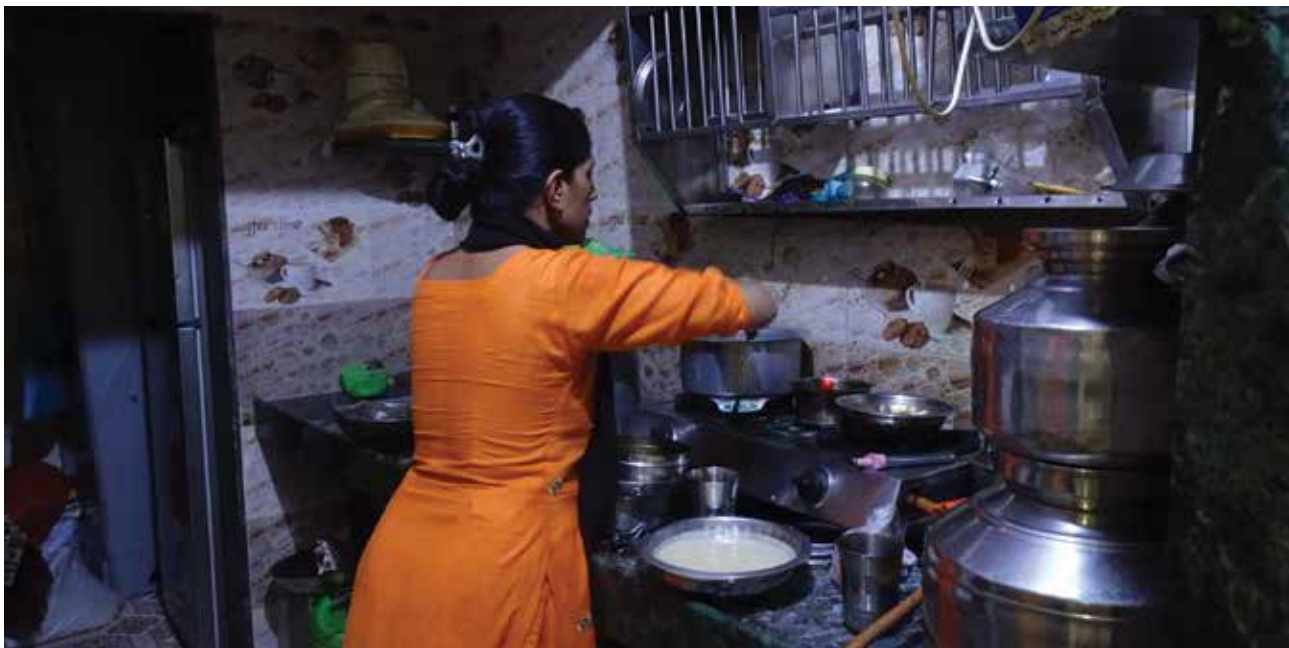
4.10 What's cooking

The responsibility of cooking for the household and ensuring that food is available to meet the needs of family members, however, is not synonymous with the responsibility to 'decide' what food is procured or cooked. One of the key themes that emerges from the study is