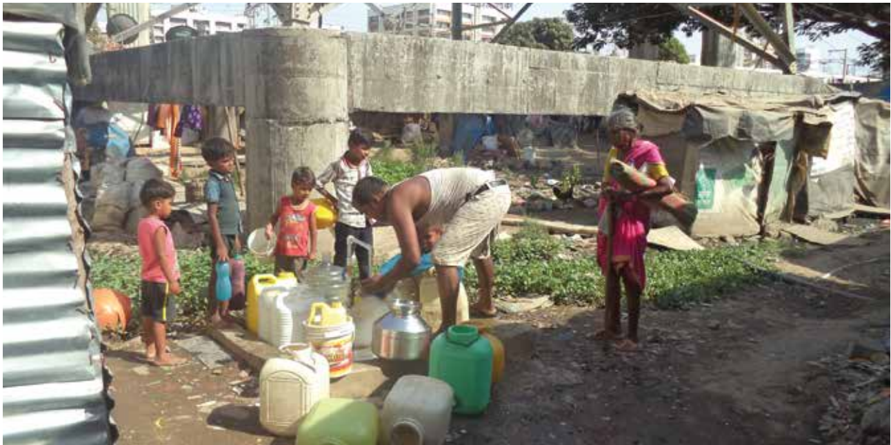
4.13 Residents of Tata Nagar queue up daily in order to access clean water from the tap located in the settlement, Photo Credit: Aradhana

The denial of habitat rights also encompasses the denial of the right to water, exacerbating the experience of food insecurity and scope for survival during mass demolitions. As explained by Smita,