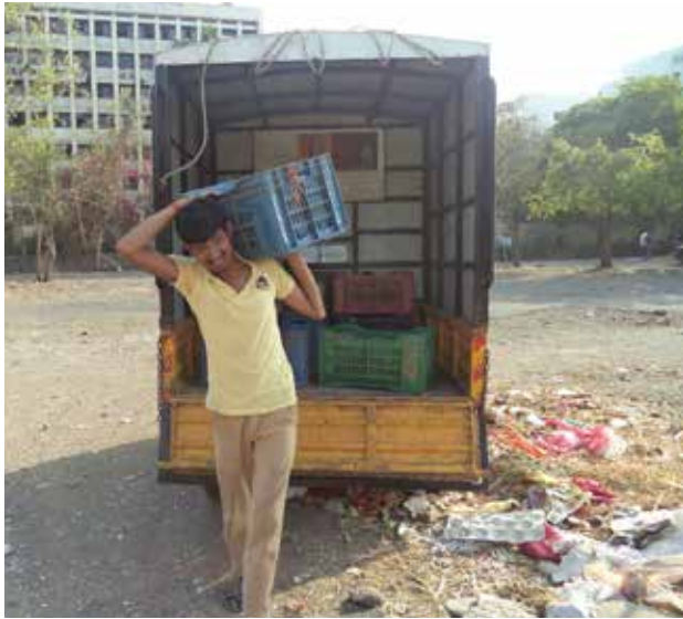
4.7 A resident of Tata Nagar carrying food items to set up shop in the nearby market, Photo Credit: Jai Singh

On the other hand, certain benefits were observed in households of vendors who dealt with the business of food items, allowing them easy access to certain types of food. Because members of Neeta's and Sunanda's families sold fish, they were able to eat fish like pomfret and seafood like prawns every day. As we saw earlier, this is not true for all, as in the case of Ram's family (see Sub Section 4.1).