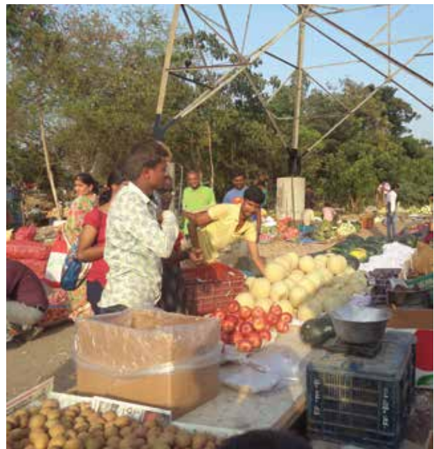
4.1 Vegetable market being set up close to Tata Nagar

were practical. Neeta, a resident of RNA colony, noted substituting dried fish for vegetables on occasion as it was relatively cheaper. This sense of practicality also shaped personal consumption patterns of women. While the average meal comprised of a number of items, what was consumed also varied depending on who was at home during the day. When children or other family members were not at home, women tended to make do with snacks or simple foods like khichdi 1 .