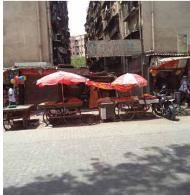
4.5 Several Ferriwalas set up shop on the roads leading to RNA Colony adding to the convenience of the residents,

You go outside the gate and it's there. Every day I buy and every day I make.